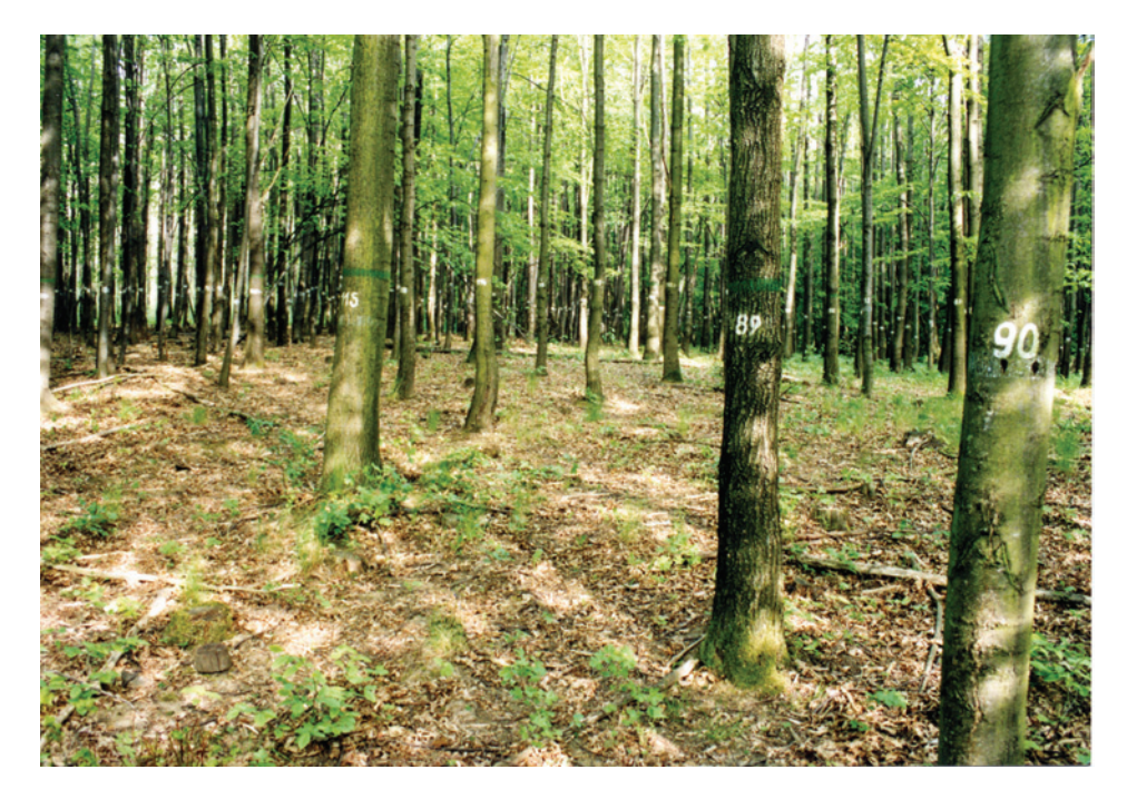
Fig. 4. Tended mixed stand of European chestnut and little linden (PRP VIII).