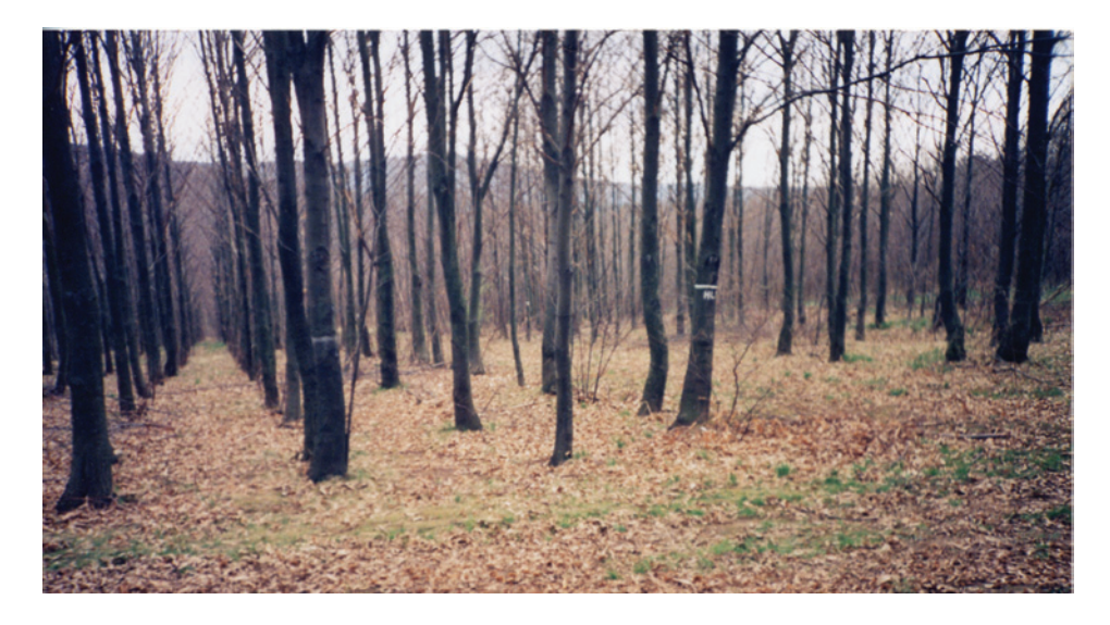
Fig. 5. Seed progeny Horné Lefantovce 17.