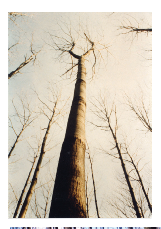
Fig. 2. Good-quality stem of European chestnut with fork-like crovn.

Fig. 3. Non tended pure stand of European chestnut (PRP I).