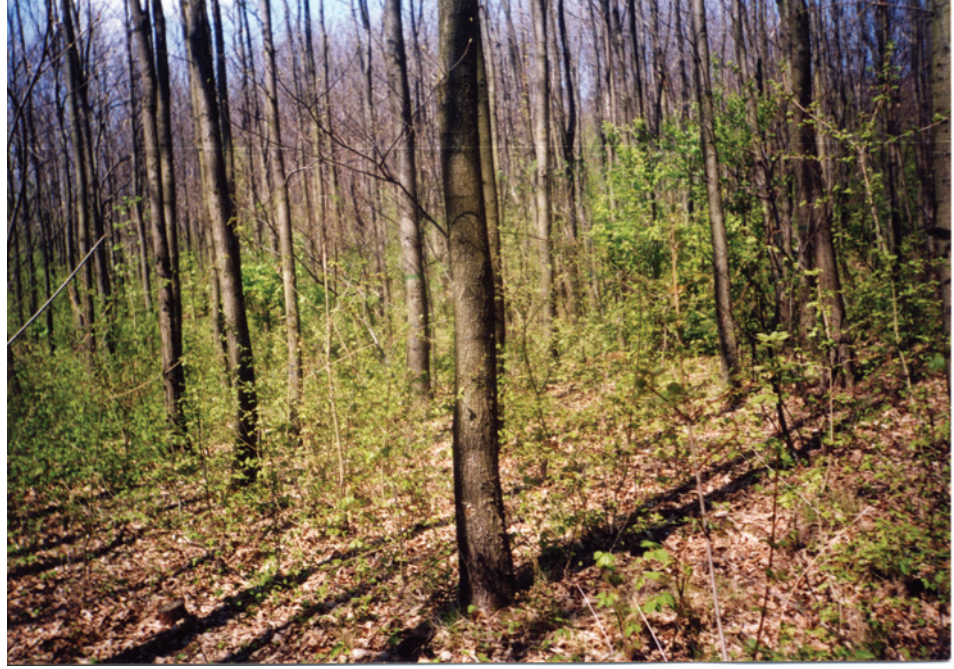
Fig. 3. Non tended pure stand of European chestnut (PRP I).

Fig. 2. Good-quality stem of European chestnut with fork-like crovn.